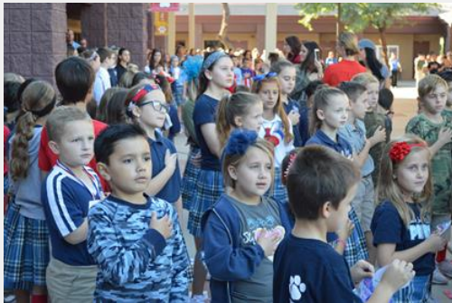
Students watching our Flag being raised