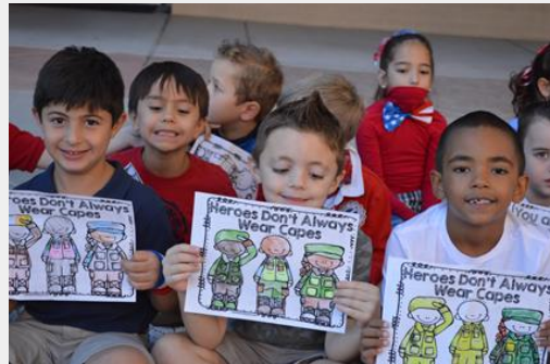
Students showing off their hero art work